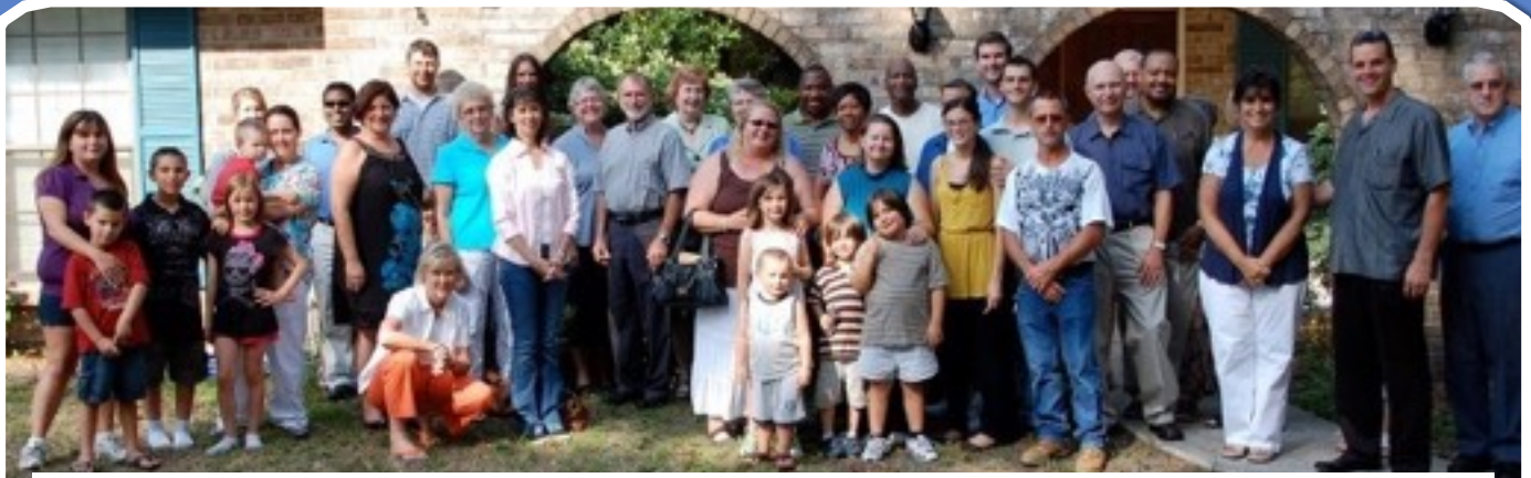
The power of collaboration was perfectly demonstrated when the members of the Clay SafetyNet Alliance (formerly The Mercy Network) came together to provide housing for displaced people, picture here at the opening of one of the group homes in 2010.