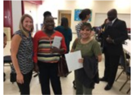
Attending monthly meetings gives stakeholders knowledge of county resources

continue solving short-term community needs by sharing resources, forming partnerships and avoiding duplication of services. In addition, they focus on expanding communication, creating a framework to proactively address community problems, and championing common projects that will benefit the whole county.